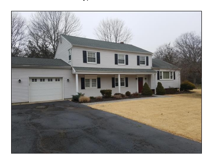
DANTE Home Inspections

Property Address: 123 South St Anyplace NJ 08000