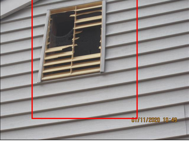
2.5 Item 1(Picture)