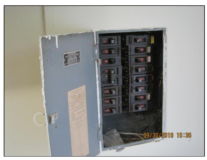
7.1 Item 1(Picture)

7.1 Main panel is missing a panel cover which is a safety hazard. Recommend placing panel cover and labeling circuit brakers.