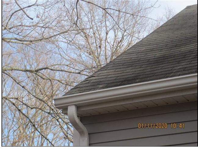
1.0 Item 1(Picture)

1.0 The roof covering is old, and the life of covering has expired. The covering does need to be replaced. While it could last a year or so, some areas may need patching with tar as leaks develop.