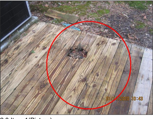
2.3 Item 1(Picture)