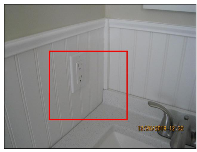
7.4 Item 1(Picture)

7.4 No GFCI present in main bathroom. Outlets within 6 feet of a water source needs to be GFCI protected. Recommend contacting a licensed professional to replace outlet with GFCI.