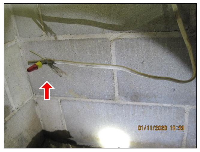
7.2 Item 2(Picture)