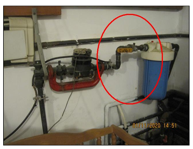
6.3 Item 1(Picture)