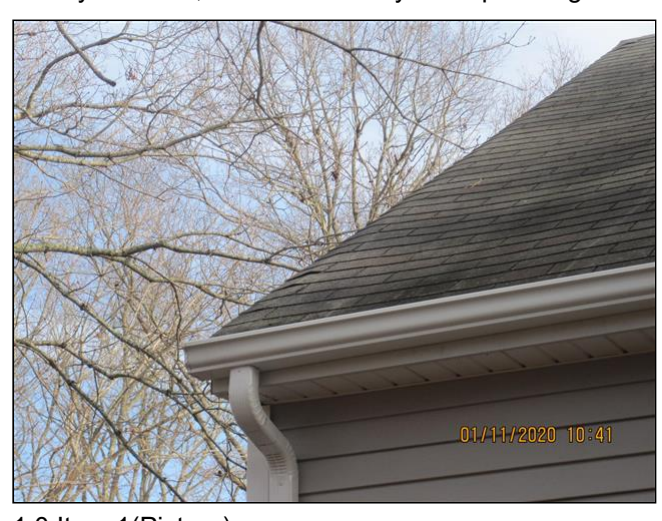
1.0 Item 1(Picture)

The roof covering is old, and the life of covering has expired. The covering does need to be replaced. While it could last a year or so, some areas may need patching with tar as leaks develop.