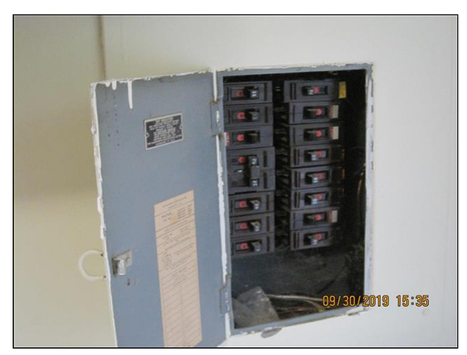
7.1 Item 1(Picture)

Main panel is missing a panel cover which is a safety hazard. Recommend placing panel cover and labeling circuit brakers.