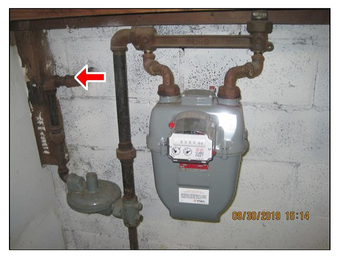
6.5 Item 1(Picture)

The plumbing in the home was inspected and reported on with the above information. While the inspector makes every effort to find all areas of concern, some areas can go unnoticed. Washing machine drain line for example cannot be checked for leaks or the ability to handle the volume during drain cycle. Older homes with galvanized supply lines or cast iron drain lines can be obstructed and barely working during an inspection but then fails under heavy use. If the water is turned off or not used for periods of time (like a vacant home waiting for closing) rust or deposits within the pipes can further clog the piping system. Please be aware that the inspector has your best interest in mind. Any repair items mentioned in this report should be considered before purchase. It is recommended that qualified contractors be used in your further inspection or repair issues as it relates to the comments in this inspection report.