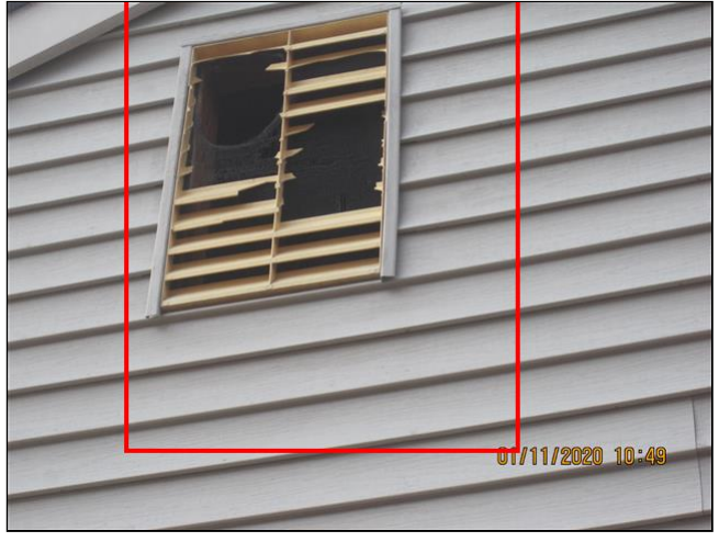
2.5 Item 1(Picture)