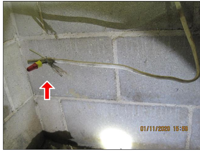
7.2 Item 1(Picture)