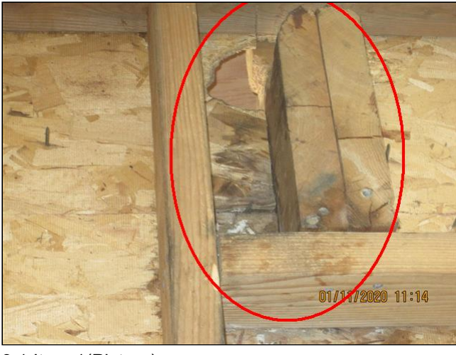
3.1 Item 1(Picture)